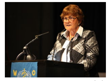
Zsuzsanna Jakab WHO Regional Director for Europe

I believe Health 2020 can add significant value to all of our individual and collective work to enhance health and well-being, serve as unique resource to enhance the future and prosperity of individual countries and the Region as a whole and benefit all its peoples. Actively informing and aligning our daily practice with Health 2020 values and approaches will enable us to build a healthier Europe for ourselves and our children.